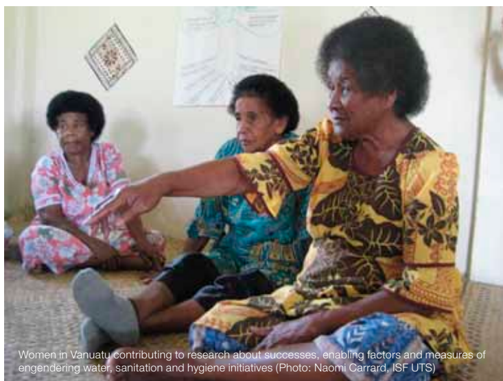
Women in Vanuatu contributing to research about successes, enabling factors and measures of engendering water, sanitation and hygiene initiatives

Networking: Networking can be helpful in negotiating gendered spaces and sharing successful strategies, both in an EEO sense and to advance gender equality in an organisation's program. Attempts to set up networks of women development workers have had a mixed record, particularly at a leadership level. Meetings of women chairs and executive directors have been organised at ACFID Council but a more regular follow up with a good spread of representation has been harder to achieve. However, the most recent incarnation of a Women in Development network has focused on activities that seek to engage a wide range of participants, with a particular focus on involving younger women. It is important for female agency heads to take a lead in advancing the gender agenda – because they are in a position to widen pathways and address barriers, and because they provide role models that confirm the potential for women's leadership in development organisations.