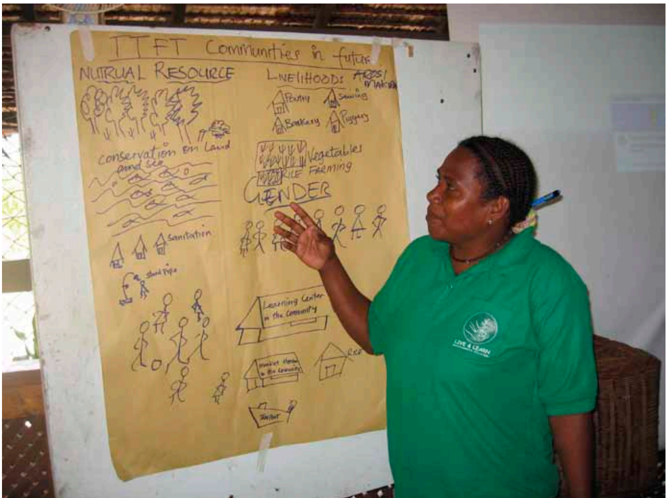
Communities planning for the future, Live & Learn Solomon Islands

Also Oxfam's Gender and Development journal focused on the issue of cultural change in and through development organisations as far back as 1997, and many of the challenges, insights and approaches documented there remain useful in anticipating issues and planning to address them with partner organisations.