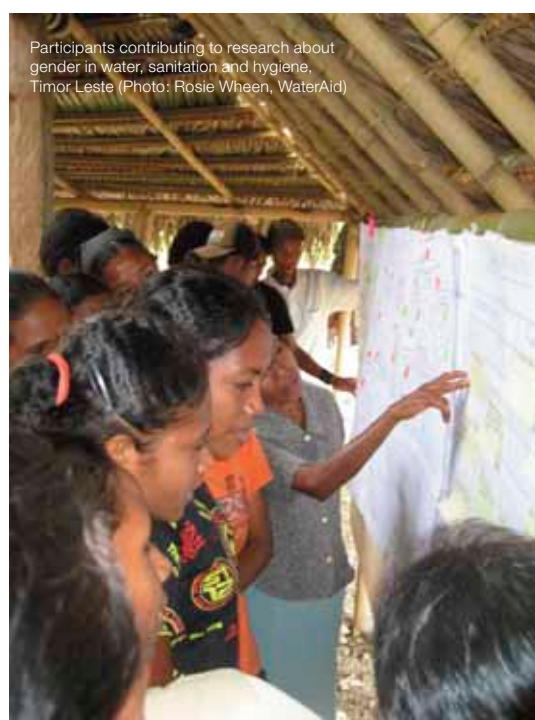
Participants contributing to research about gender in water, sanitation and hygiene, Timor Leste

The history of Gender and Development across the development sector as a whole and also within NGOs is that it has occurred in 'fits and starts' and while important initiatives have been put in place over the past thirty years these have not been followed through consistently so that gender is socialised across agencies and therefore becomes 'second nature' in the policies and practices within NGOs. We know what is needed and what works. The focus needs to be on mobilising and sustaining the political will and resourcing to enable knowledge to translate into action.