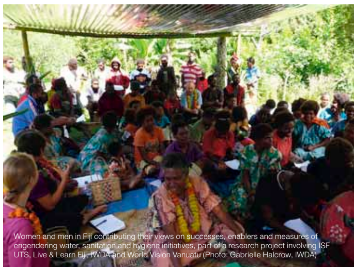
Women and men in Fiji contributing their views on successes, enablers and measures of engendering water, sanitation and hygiene initiatives, part of a research project involving JSF UTS, Live & Learn Fiji, IWDA and World Vision Vanuatu

Agencies clearly recognised a gap in humanitarian programming, with urgency and a traditionally strong male culture in the delivery of emergency humanitarian assistance resulting in weak gender analysis and limited gender-responsiveness. Agencies such as World Vision Australia have recognised that 'gender and emergencies hasn't got enough attention'. For World Vision, improving this situation 'means understanding gender work prior to the emergency, and so how we can use the pre-existing information on gender in programming'. They also try to deploy mixed teams wherever possible.