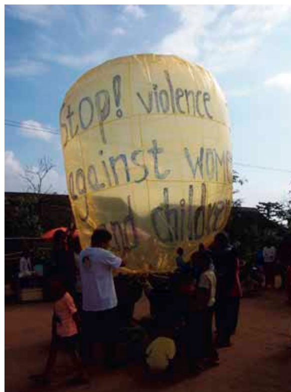
Giant lantern being lit for the International Day to Eliminate Violence Against Women in an unofficial refugee camp for Shan people in Thailand

Women in developing countries experience a range of barriers to accessing education, support and other services associated with their gender roles and responsibilities and with prevailing gender inequalities; these are magnified for women with a disability. The evidence shows, for example, that while women will come to screening, they will often not come for treatment because of barriers such as transport issues, costs, and time out of the home. Consequently, treatment and support for people with a disability can inadvertently focus on men. In some cases a historical medical approach to dealing with particular disabilities such as blindness has resulted in the predominance of male doctors and a gender-blind, technical response to treatment and support. Agencies have found that gender champions offer one way to overcome such issues. Where a local office had a gender champion with the disability, changes in practice and reach to women were more evident.