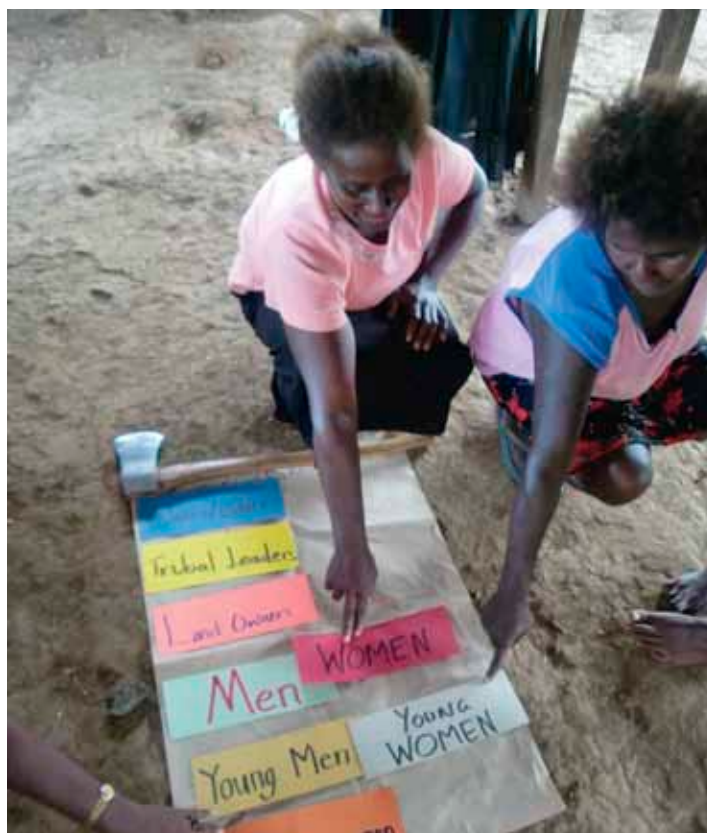
Women participating in a power analysis of decision-making about natural resources within their community, part of the design process for an IWDA-Live and Learn Environmental Education (Live & Learn) project in Solomon Islands

Likewise for UNDP, the process of change was very slow, but here some progress has been made. In the early years, gender was at best an add-on: in evaluations undertaken in 1978 and 1985, only one